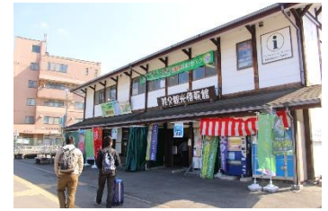
Chichibu Tourist Information Center