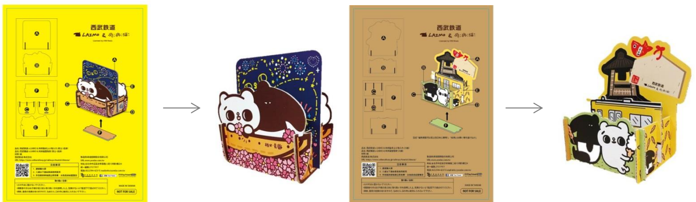
SEIBU RAILWAY×LAIMO & SONG SONG MEOW original limited edition goods (containers)

(Left: Chichibu Version, Right: Kawagoe Version)