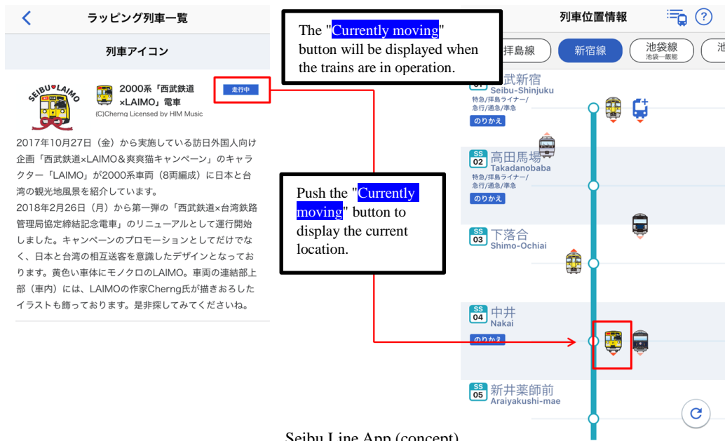
Seibu Line App (concept)

※ Some types of smart phones can not download this application.