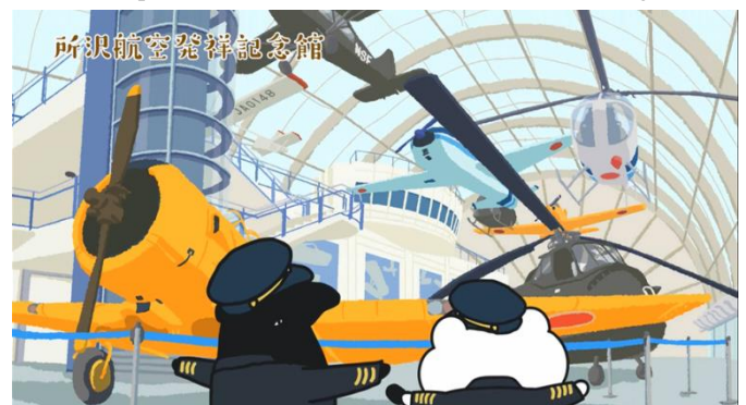
Original animation (Left: Picking tea at Miyanoen, Right: Viewing exhibits at Tokorozawa Aviation Museum)