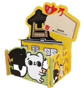
SEIBU RAILWAY×LAIMO & SONG SONG MEOW original limited present (containers) (Left: Chichibu Version, Right: Kawagoe)