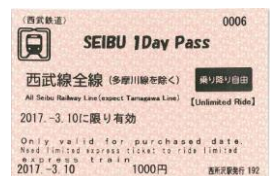
SEIBU 1Day Pass ticket image