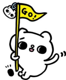
SONG SONG MEOW