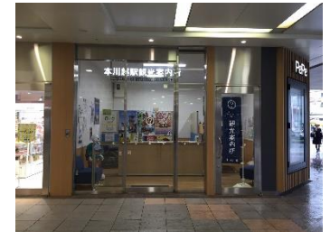
Hon-Kawagoe Station Tourist Information Center