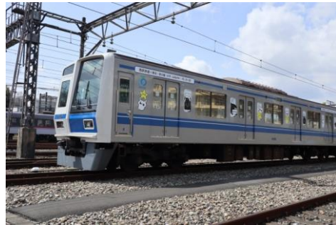
SEIBU RAILWAY x Chichibu/Hon-Kawagoe with LAIMO & SONG SONG MEOW wrapped train

★ You can check the current location of the wrapped trains on the SEIBU RAILWAY App!