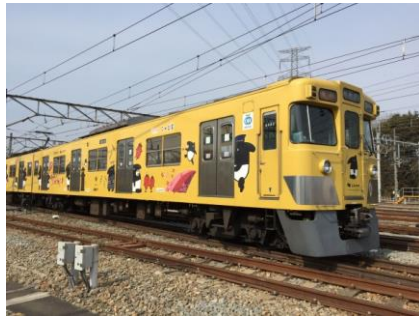
SEIBU x LAIMO wrapped train

Hon-Kawagoe: Tokino-Kane bell tower, Kawagoe Hikawa Shrine Ema (votive picture of horses), kimono and Japanese dango.