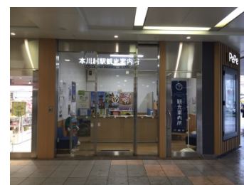
Hon-Kawagoe Station Tourist Information Center