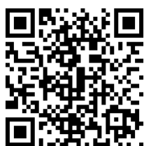
Campaign Site QR Code

The Campaign page not only have the detailed information of this campaign but also have extra recommend spots' information which are not able to introduced on the flyer. An original Animation will also be uploaded to the site. The Campaign website is planning to be ready at the end of October.