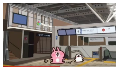
Original Animation ※Image